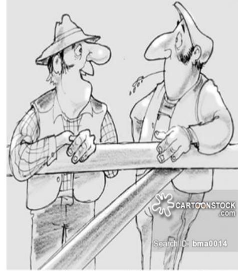
"...and here I was...only just getting used to being paid for NOT doing things."